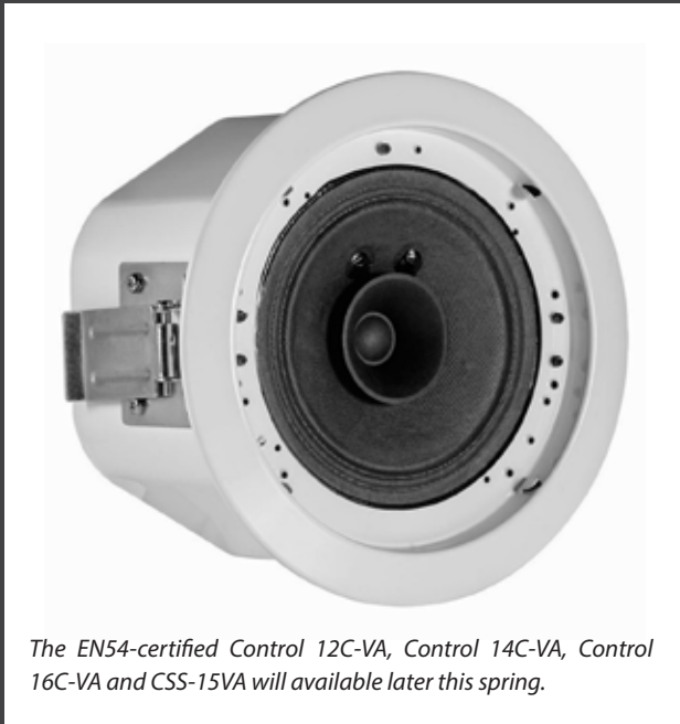
The EN54-certified Control 12C-VA, Control 14C-VA, Control 16C-VA and CSS-15VA will available later this spring.